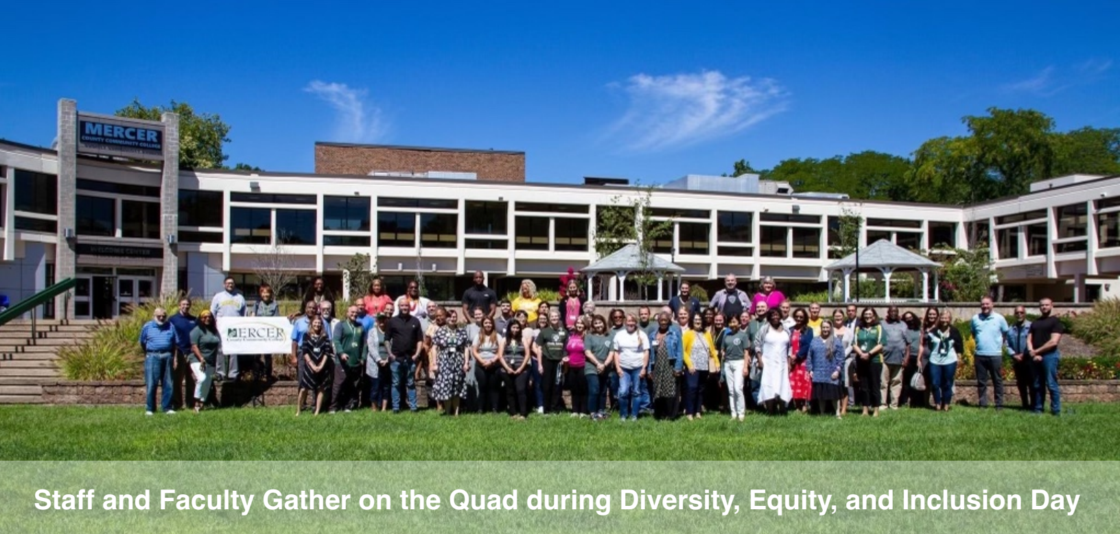
Staff and Faculty Gather on the Quad during Diversity, Equity, and Inclusion Day