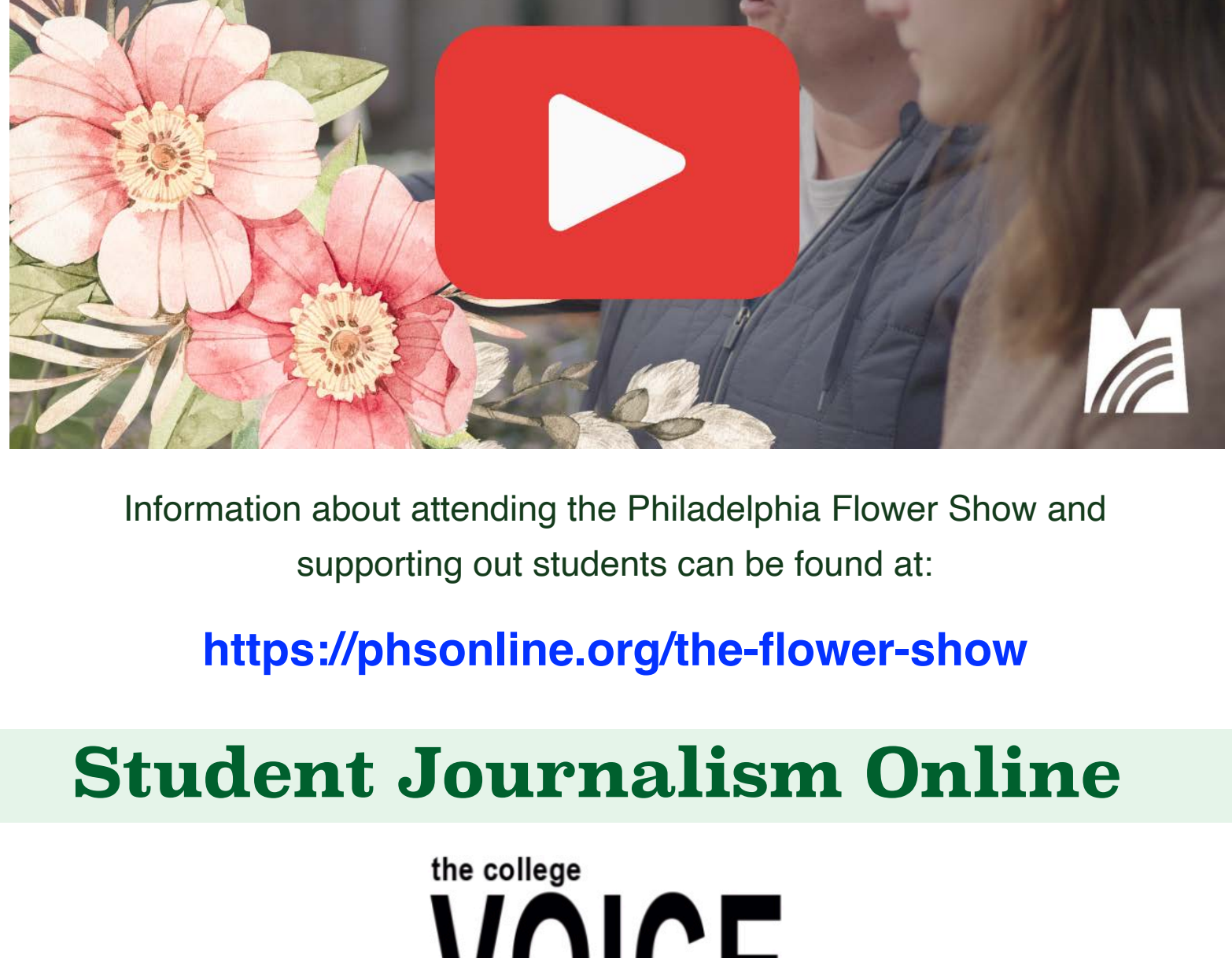
MCCC Horticulture Program preparation for the 2023 Philadelphia Flower Show

Information about attending the Philadelphia Flower Show and supporting out students can be found at: