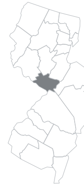
MERCER COUNTY, NJ

Mercer County Community College (MCCC) creates a significant positive impact on the business community and generates a return on investment to its major stakeholder groups—students, taxpayers, and society. Using a two-pronged approach that involves an economic impact analysis and an investment analysis, this study calculates the benefits received by each of these groups. Results of the analysis reflect fiscal year (FY) 2018-19.